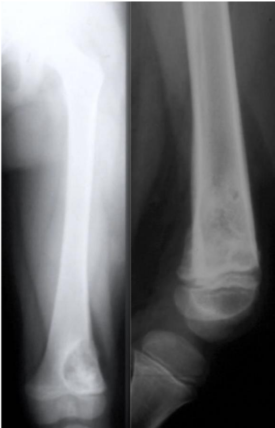
Figure 1. The neoplastic lesion at the beginning in October 1988

In 1989, the patient underwent “En bloc” resection of the distal femur and proximal tibia, on safety margins, and to limb reconstruction with expandable megaprosthesis (Fig. 2).