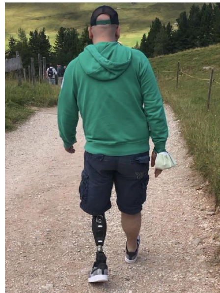
Figure 9. Daily activity at 18 months after surgery

An antibiotic therapy (1 × 600 mg Linezolid tablets twice/day) was started just after the surgery and prolonged for up to 8 weeks. A specific rehabilitation protocol was started since the discharge from the hospital. Clinical and X-ray evaluations were performed every 3 months. Wound healing was achieved without major complications and the definitive prosthesis was dressed 10 weeks after the surgery. Full weight-bearing walking was allowed at 8 weeks after surgery. The patient returned to his work as an orthopedic surgeon 4 months after the surgery (Fig. 6). At the last follow-up, after 18 months, an excellent osteointegration without signs of resorption of the graft were observed. Clinically, the patient showed a good functional recovery (Fig 9.) measured with SF12 (PCS-12 (Physical Score): 53.1879|MCS-12 (Mental Score): 60.17871) and Berg Balance Scale (50 pt) without any sign of recurrence of the infection. An RX evaluation of fibula integration is yet to be assessed at six months (fig. 10) and at two years (fig.11).