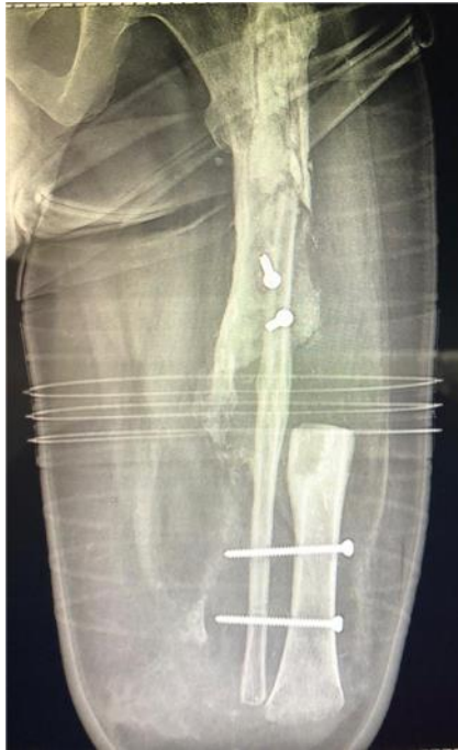
Figure 10. RX at six months after surgery