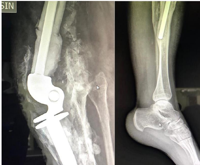
Figure 4-7. The condition of the implant when decided for the amputation