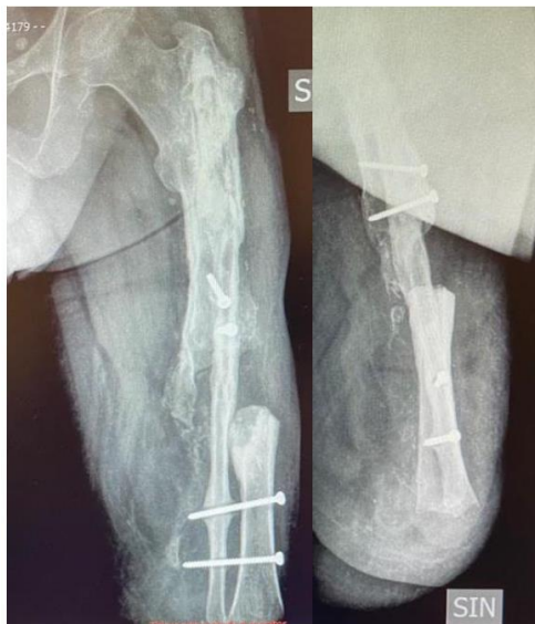
Figure 11. RX at two years after surgery in AP and LL