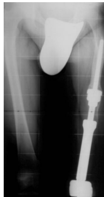
Figure 3. Expandable prosthesis in the elongation stage

The patient was in supine position, all the fistula traits were removed and the megaprosthesis was explanted using a large surgical approach. An aggressive debridement of the remaining periprosthetic tissues was performed. The cement was carefully removed from both the femoral and tibial canals and an amputation of the tibio-astragalic joint was also performed.