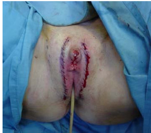
Fig. 5: Intraoperative view after suture of the flaps.

couraging problems to face, such as finding a sexual identity, the impossibility of having children and psychological stress for operations and hormonal therapy (1), the clitoroplasty method followed by labia majora hypertrophy correction should guarantee normal external appearance preserving the sensitive function.