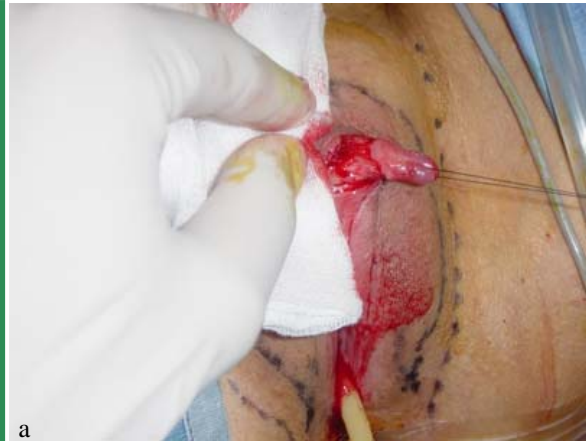
Fig. 3 a, b : The clitoris with the neurovascular bundle is separated from the ventral corporal tissue, that are completely excised.

had been seen with the pubic lesion. Sensation and sexual satisfaction were reported to be normal and satisfactory at short follow-up. She did not report dryness or other problems during coitus. The patient is very pleased with the final cosmetic result.